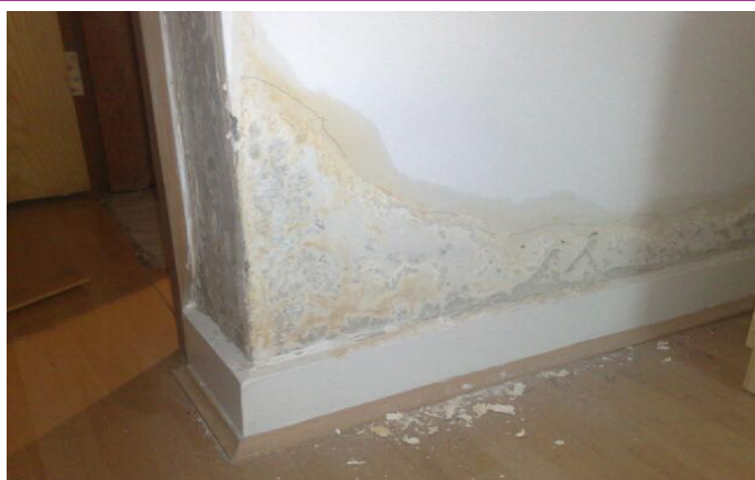
Rising damp with salt deposits and crumbling plasterwork

A common diagnosis of rising damp is the presence of salt deposits and alternatively if black mould is on the surface, this will not be rising damp as black moulds won't grow where salt is present.