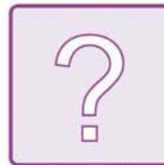
Any other format