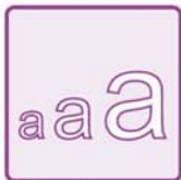
In large type

درخواست پر یہ دستاویز دیگر زبانوں میں، بڑے حروف کی چھپائی اور سننے والے ذرائع پر بھی میسر ہے۔