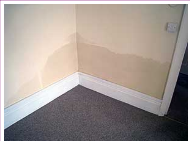
Rising damp from floor level before plaster damage has taken place

Rising damp can arise for various reasons, the common causes are; failure of an existing damp proof course (DPC) and bridging due to raising of either external or internal ground levels.